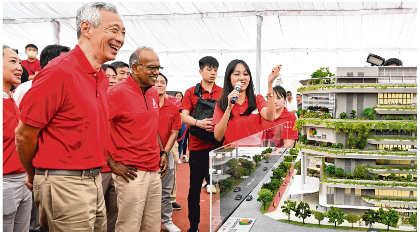
Prime Minister Lee Hsien Loong, with Law and Home Affairs Minister and Chong Pang MP K. Shanmugam, viewing a model of Chong Pang City on Sunday. Agencies like the Singapore Land Authority and People's Association had solicited residents' feedback on the features they wanted for the hub.

When completed in 2027, the community hub will rejuvenate the 40-year-old neighbourhood with new facilities such as swimming